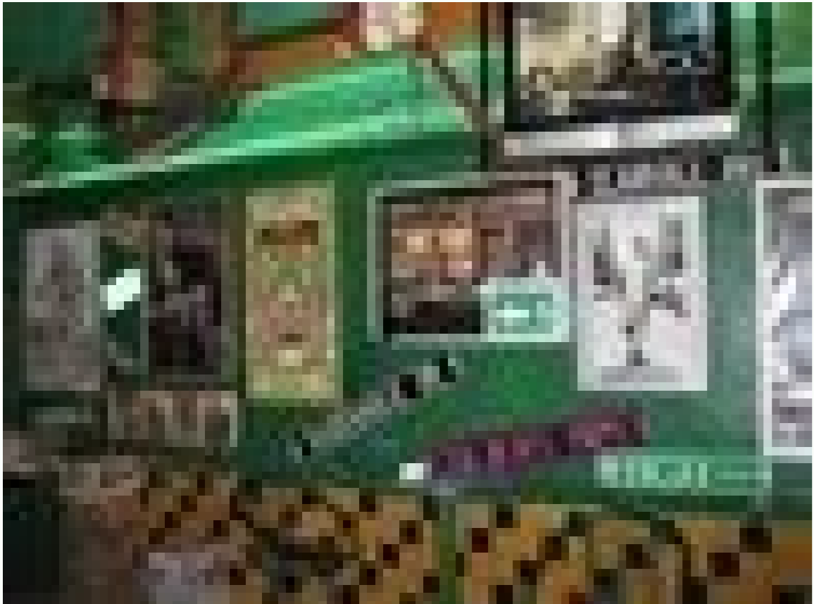
Is the border open at algodones mexico. Los algodones mexico green door. Green door bar algodones mexico.